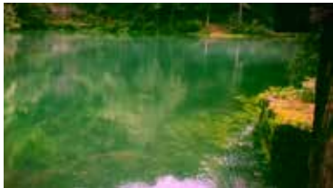
all colors are similar