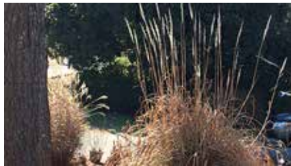
contrast of light and dark