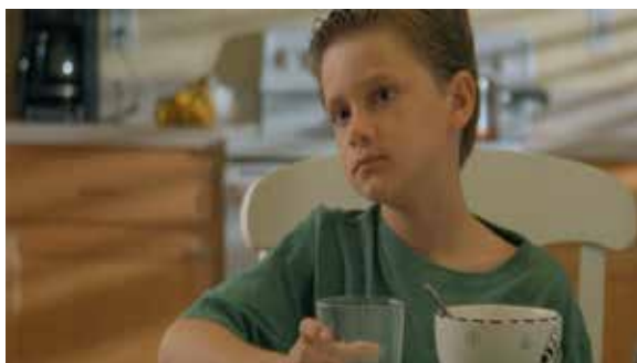
appropriate kitchen props, but no clutter