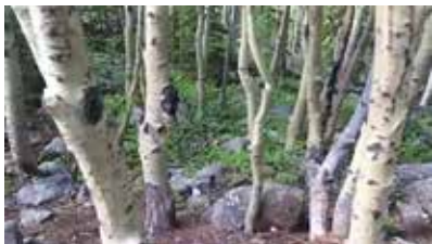
repeating straight lines