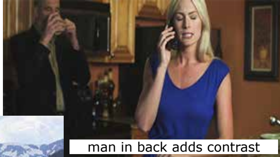
man in back adds contrast