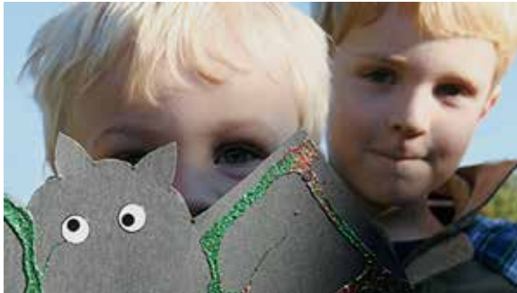
all shapes (masses) balance each other in a pleasing way