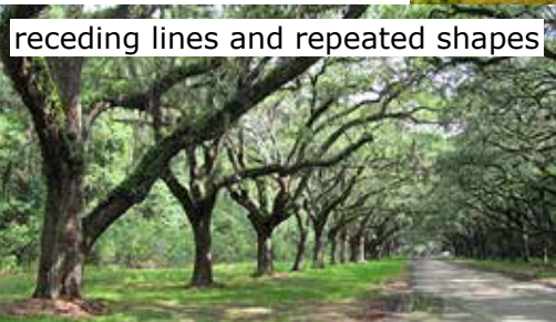
receding lines and repeated shapes