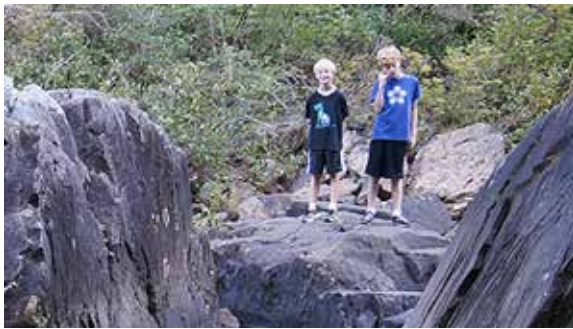
rocks frame the boys