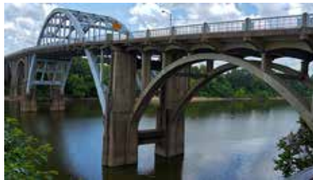
the bridge is the subject