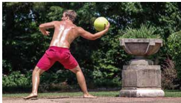
warm and cool colors contrast