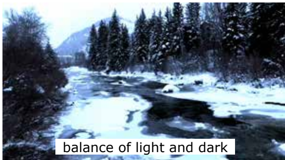
balance of light and dark