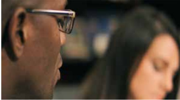
focus starts on the man on the left

these two images are from different moments in the same video clip