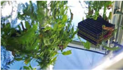
contrast of texture