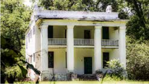
stability contrasts with decay