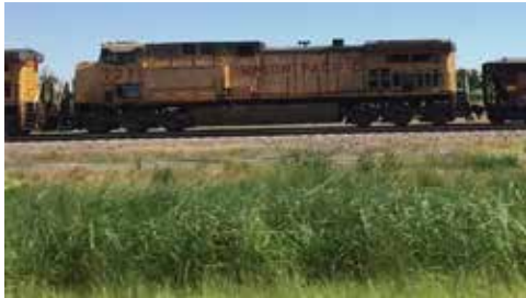
ground is 2/3, train is 1/3

lines between water, rocks, and rainbow all serve to divide this image into thirds both horizontally and diagonally