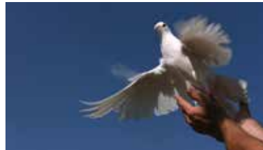
this low angle draws our attention to the open sky above