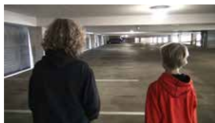
tracking OTS with 2 people