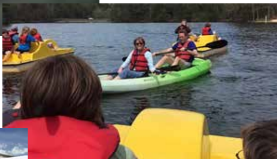
balance of water and people