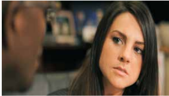
focus shifts to the woman on the right

these two images are from different moments in the same video clip