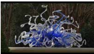
the sculpture is the subject