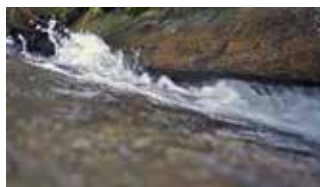
focus is in background