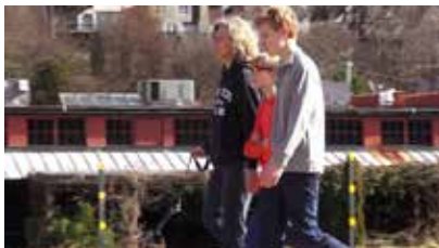
tracking by panning with them as they walk (don't forget the rule of leading looks)