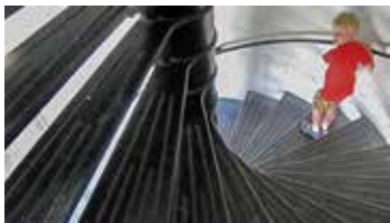
repeating diagonal lines fan out radially, then the boy's red shirt contrasts