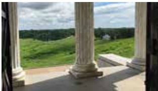
foreground frames background