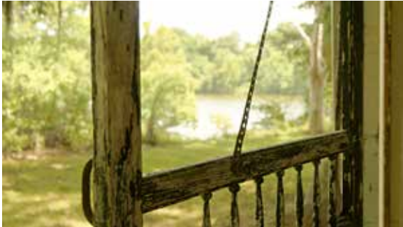
door frames outside world