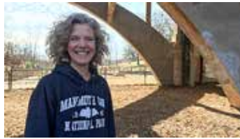
framed by bridge