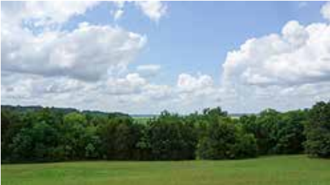
everything is at similar depth