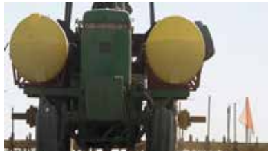
tractor seems powerful because of the camera's low angle