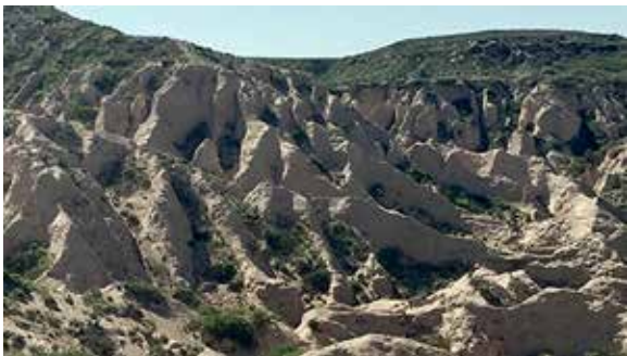
repeating textures and colors