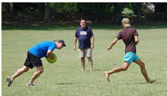
the three people balance each other