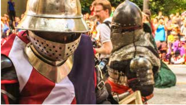
the masked knight is the subject