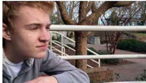
rail lines divide into thirds