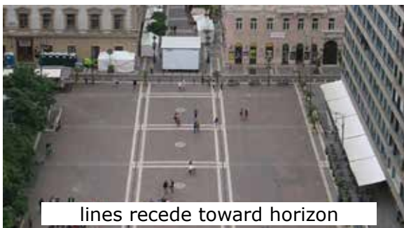
lines recede toward horizon