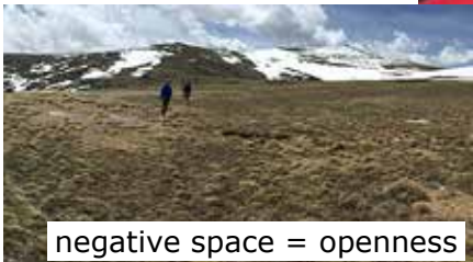
negative space = openness