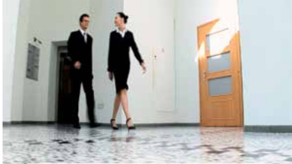
these businesspeople seem confident because of our low angle