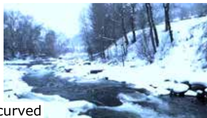
interplay of light and dark, straight and curved