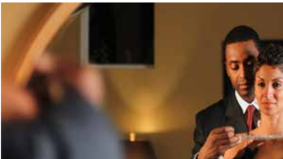
the mirror frames and creates depth