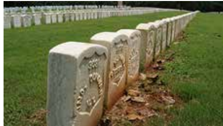
row of stones connects back to front and creates depth