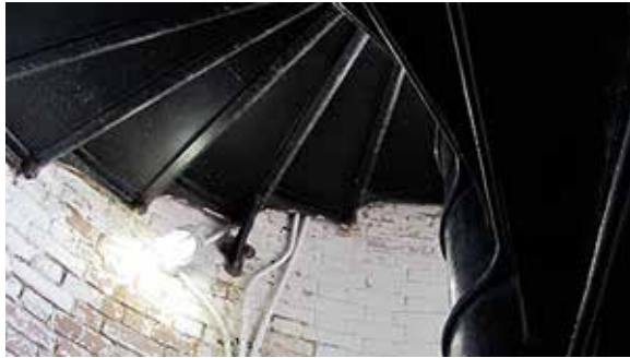
contrast of color