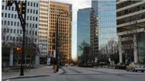
static, but still interesting