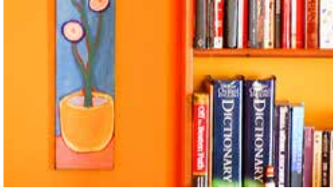
mostly vertical and horizontal lines