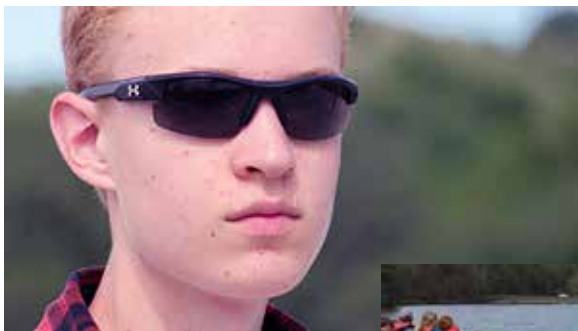
negative space behind boy