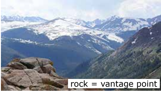
rock = vantage point