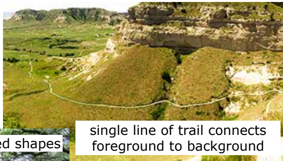
single line of trail connects foreground to background