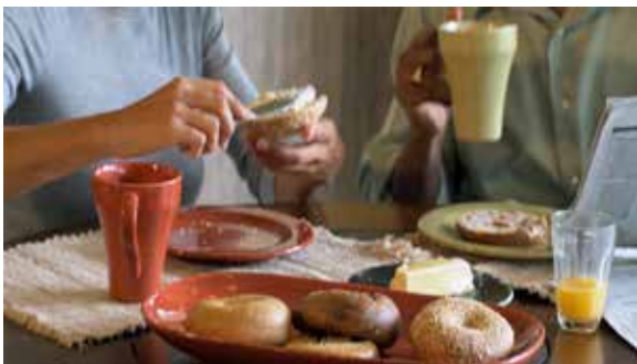
just the right amount of props